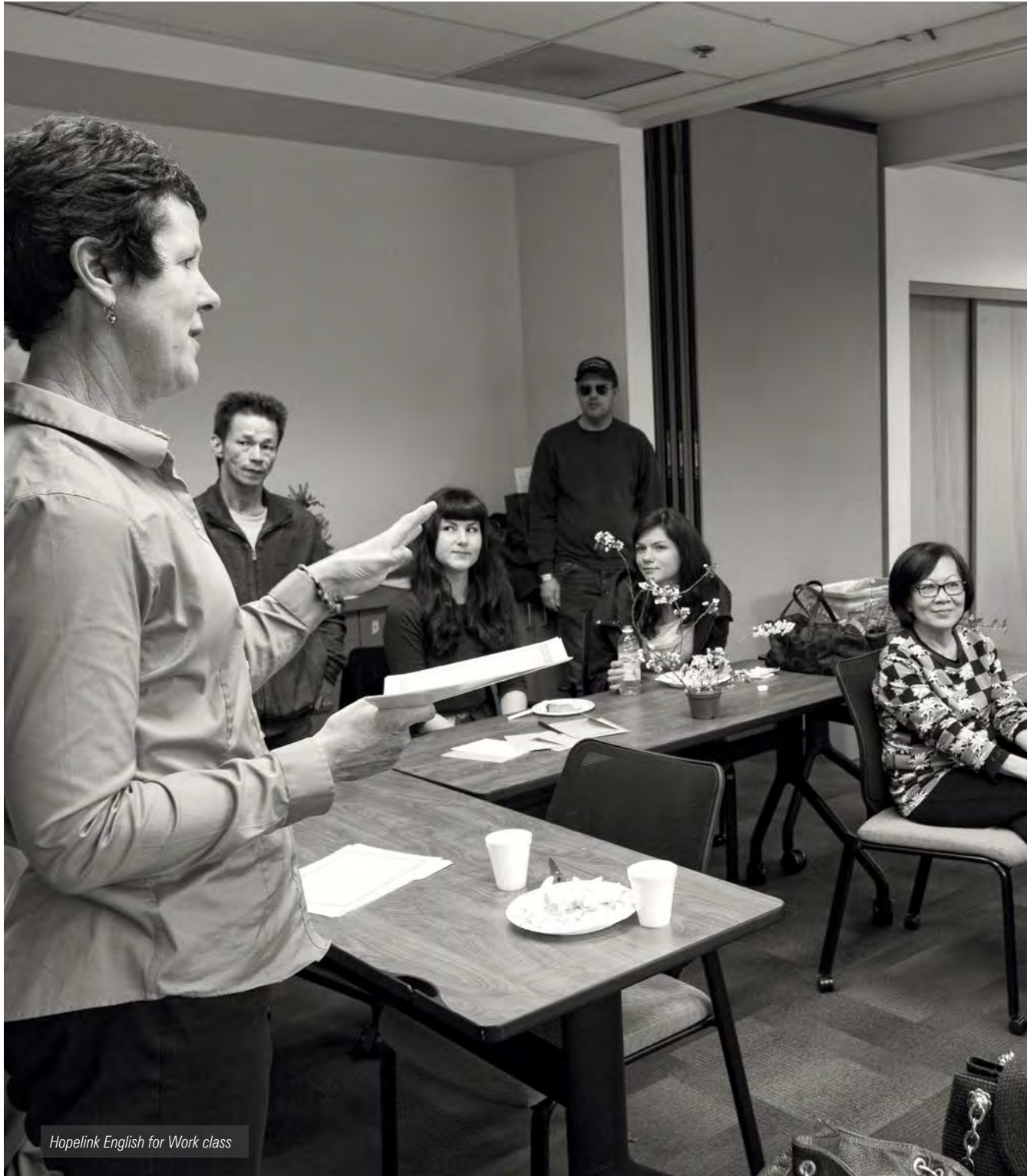
Hopelink English for Work class